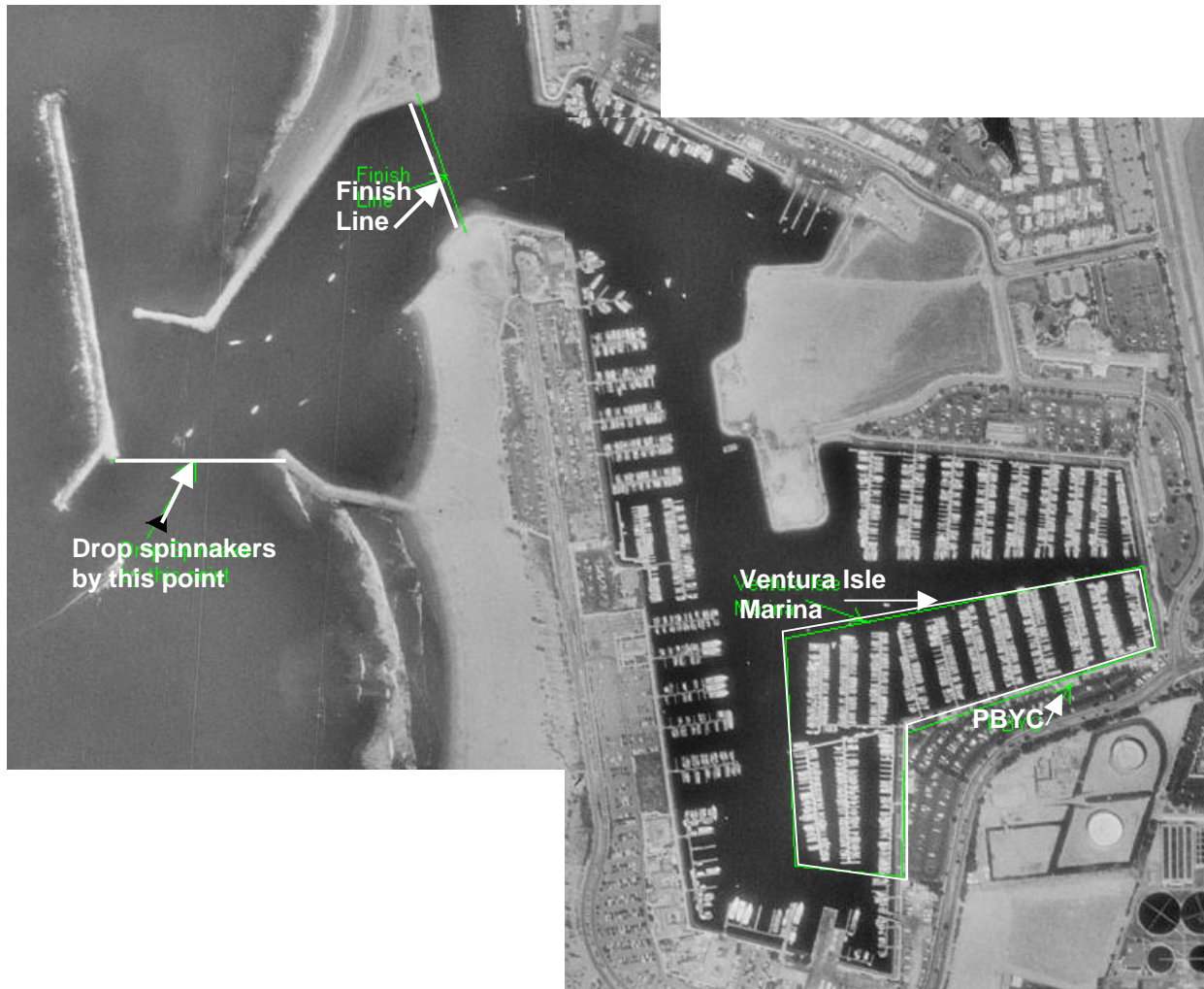
Figure 2: Ventura Harbor Entrance Showing Finish Line, Ventura Isle Marina, and PBYC